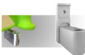
RS0056 -CLAMP FOR I.V. STAND AND OXYGEN TANK HOLDER