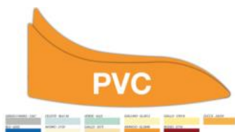
RS0060 -COLOURED LABELS PAIR MADE OF PVC FOR SL 6020-SL6030 HEAD/FOOT PANELS