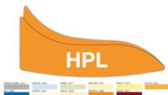
RS0062 -COLOURED LABELS PAIR MADE OF HPL FOR SL 6020-SL6030 HEAD/FOOT PANELS