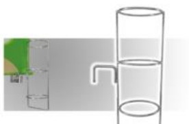
RS0146 -STEEL BOTTLE HOLDER