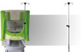
RS0023 -I.V. STAND WITH 2 HOOKS AND ADJUSTABLE HEIGHT